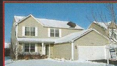
LAKE IN THE HILLS 3 BR+Loft, 2-1/2 BA, 2-Tier Brick Patio, Fin Bmt, Islnd Kitch w/Bayed Eat Area, Cathdrl Mstr w/Whrpl BA $304,900 Code 3205