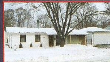
CARPENTERSVILLE 3 BR+Den/4th BR, 1 BA, All-New Kitchen, New Carpet Thruout, Fireplace, New Furnace, 2-1/2 Car+1-Car Gars $155,000 Code 9505