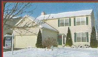
LAKE IN THE HILLS 4 BR, 2-1/2 BA, Fenced Yrd w/Deck, Fin Bmt, Kitch w/42" Maple Cabs, FR w/Fpl, Vaulted Mastr, Hrdwd Flrs $280,000 Code 4805