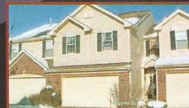
ALGONQUIN 3 BR+Loft, 2-1/2 BA, Fin Bmt w/Wet Bar, Huge Master w/Sit Rm & Whrpl BA, Fpl, Vaulted Ceils, Custom Finishes $264,900 Code 9405