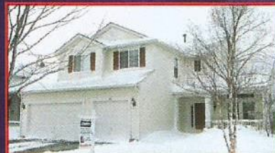
LAKE IN THE HILLS 3 BR, 2-1/2 BA, Fin Bsmt, Island Kitch, Master w/Sit Rm & New BA, Fenced Yard w/Patio & Inground Pool $339,900 Code 8005