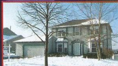
LAKE IN THE HILLS 4 BR, 2-1/2 BA, Fin Walkout Bsmt w/5th BR/Ofc & 2 Rec Rms, Fenced Yard w/Deck, Gazebo, & Sprinkler Syst $300,000 Code 6005