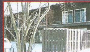
ALGONQUIN 2 BR, 2 BA, Park & Stream Views, Private BA For Each BR w/Cer Tile & New Vanities, Updated Kitch w/GT Flr $146,900 Code 3405