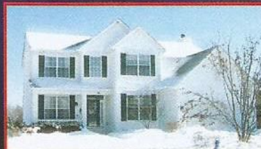
ALGONQUIN 4 BR+Loft, 2-1/2 BA, 1st Flr Den, FR w/Fpl, Eat-In Island Kitchen, Full Bsmt, Cathedral Master Ste, 9ft Ceils $349,900 Code 8205