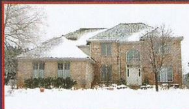
LAKE IN THE HILLS 4 BR, 3 BA, Full Bsmt, 2Story FR w/Fpl, 1st Flr Den/5th BR & Full BA, Skylts, Hrdwd Flrs, Cthdrl Ceils $550,000 Code 2005