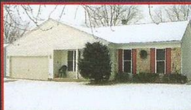
ALGONQUIN 3 BR, 2 BA, Full Bsmt w/Full BA, Vaulted LR w/Fpl & Pergo Flr, Cer Tiled Kitch & DR, Fenced Yard, Deck & Patio $215,000 Code 4705