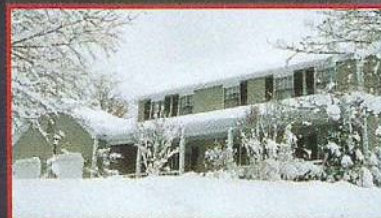
CRYSTAL LAKE 4 BR+Den, 3-1/2 BA, Fin Walkout Bsmt w/2nd Kitch, Full BA, & Sep Yard, 1+ Acre w/Mature Trees, Hardwd Flrs $469,900 Code 5305