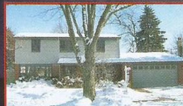
CARPENTERSVILLE 3 BR, 2 BA, Charming Cabin Atmosphere, Vaulted Fam Rm w/Slider To Deck & Fenced Yard, Bsmt w/Ext Access $209,900 Code 6205