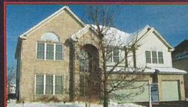
ALGONQUIN 4 BR, 3-1/2 BA, Fenced Yard, Fin Engl Bmt w/Wet Bar & Full BA, Islnd Kitch, 2-Stry FR w/Fpl, Whrpl, Hardwd Flrs $499,900 Code 4305