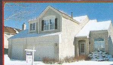
LAKE IN THE HILLS 4 BR, 2-1/2 BA, 3-Car Gar, Full Bsmt, Cathedral Ceilings, Fireplace, Luxury Master Suite, Neutral Decor $274,900 Code 7005