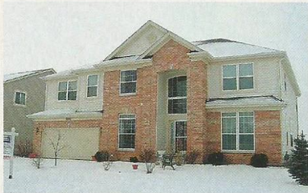
GRAND & GORGEOUS 5 BR, 3-1/2 BA, 1st Flr Den, Full Basement, Island Kitch w/42" Cabs & Cer Tile Flr, 2-Story FR w/Marble Fpl, 1st Flr BR & Full Bath, Patio, Backs To Pond. Huntley $439,900 Code 3606

24 hr talking info: 1.800.784.6248 enter code