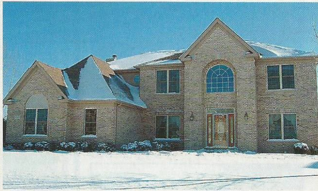
PUTTIN' ON THE RITZ 5 BR, 3-1/2 BA, Fin Engl Bsmt w/Wet Bar & Full BA, Crown Moldings, Custom Gourmet Kitch w/Granite Counters, 42" Cherry Cabs, W/I Pantry, & Top-Of-The-Line Appls, Sunrm w/Hardwd Flr & Slider To Deck, 2-Story FR w/Fpl, Vaulted Master Ste w/2 W/I Clsts & Whrpl BA, Jack & Jill BA, Dual Staircase, 3-Car Gar, 33ft Pool W/Deck & Bar. Algonquin $595,000 Code 6306