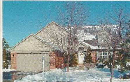
FINISHED WALKOUT BASEMENT 5 BR+Den, 3-1/2 BA, FR w/Fireplace, Mastr Ste w/Cathrl Ceil, W/I Clst, & Whrpl BA, Fin Walkout Bsmt w/2nd Fpl, Ofc, BR, & BA, Backs To Preserve. Algonquin $389,900 Code 4106