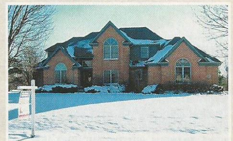
HUGE PRICE REDUCTION 4 BR, 3-1/2 BA, 1st Flr Master Ste+2nd Flr Private Ste, Jack & Jill BA, FR w/Custom Ceil & Brick Fpl, Island Kitch, Full Bsmt, Large Deck, 3/4 Acre. Lakewood $449,900 Code 8106