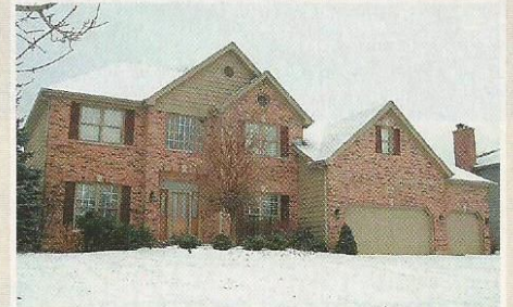
MOUTHWATERING UPGRADES 4 BR+Den, 3-1/2 BA, Full Fin Bmt w/Full BA, Hrdwd Flrs, Islnd Kitch w/42" Cabs, 2-Stry FR w/Fpl, Cathdrl Mastr w/Whrpl BA, Skylts, Patio, 1/2 Acre. Algonquin $595,000 Code 4206