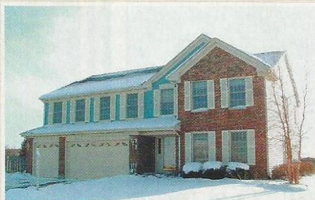
TEEN RETREAT 5 BR, 4 BA, Fin Bsmt w/2 BRs, Rec Rm & Full BA, 2-Story FR, 1st Flr BR & Full BA, Hardwd Flrs, Cathedral Master Ste w/2 W/I Clsts, Private Yard w/Patio. Algonquin $374,900 Code 2406