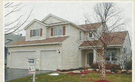
RESORT-LIKE SURROUNDINGS 3 BR, 2-1/2 BA, Fin Bmt, Cer Tile Flrs, Eat-In Kitch w/42" Maple Cabs, Mstr w/Cthdrl Ceil, Sit Rm, & All-New BA, Fnkd Yrd w/Inground Pool. Lake In The Hills $339,900 Code 8006