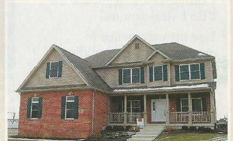
IN-LAW ARRANGEMENT 5 BR, 4 BA, Builder's Model, Finished Engl Bsmt w/BR & Full BA, 1st Flr BR & Full BA, Hardwood Floors, Master Ste w/Sit Rm & Whrpl BA, 7 Minutes To Tollway. Union $449,900 Code 6606