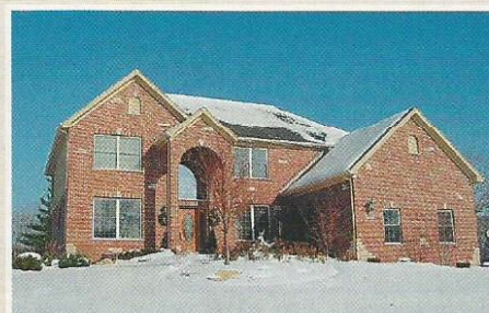
1 ACRE ESTATE LIVING 4 BR, 4-1/2 BA, Fin Eng Bmt w/Full BA, Islnd Kitch w/Granite Counters & 42" Maple Cabs, 2-Story FR w/Fpl, Den, Master Ste+Princess Ste, 2x6 Const. Crystal Lake $685,000 Code 2706